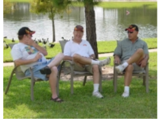
Some HOTMC members give a whole to meaning to the term "bench racing"

As an aid to our newer members in deciding what boats to build for 2009,