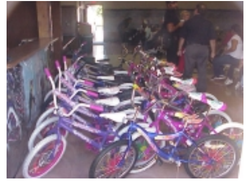
The 20 bicycles some lucky boys and girls received for Christmas

Insane Boats plans to raffle a couple of boat hulls on the website sometime in October 2009. All the proceeds from the raffle will go to assist in the VFW's annual Christmas toy give away to make it an even more exciting event than this year.