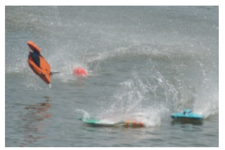
Some tough racing action. Lane one doesn't always bring home a win

We are looking forward to our water becoming liquid again and we expect a great and fun boating season in 2009.