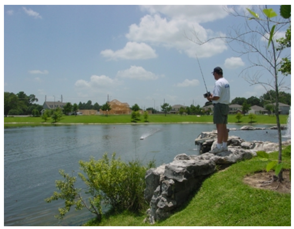
They say a picture is worth a thousand words. Somebody is having a great day off testing at the local pond

But all isn't rosy. Other clubs using these brushless power systems discovered that they can be very propeller-sensitive. Racers who are skilled in prop tweaking have a major speed advantage over those racers who lack these skills. Because these two