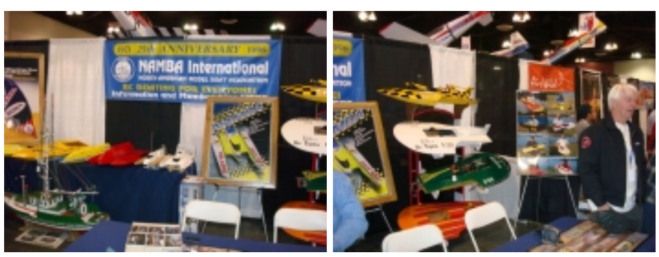
All types of R/C boats were represented at the NAMBA display booth

One thing unique about this year's expo was the number of displays touting electric. With the improved technology of Lithium Polymer (Lipo) batteries and charging equipment, motors for cars, planes, and boats can run longer, faster, and much safer. And in my case...the new helicopter I just purchased at the expo.